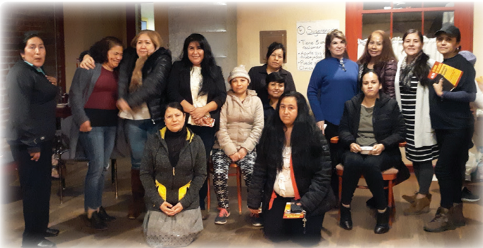
Alianza de Mujeres Activas y Solidarias (ALMAS) of the Graton Day Labor Center