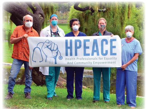
Healthcare Professionals for Equality and Community Empowerment (H-PEACE)