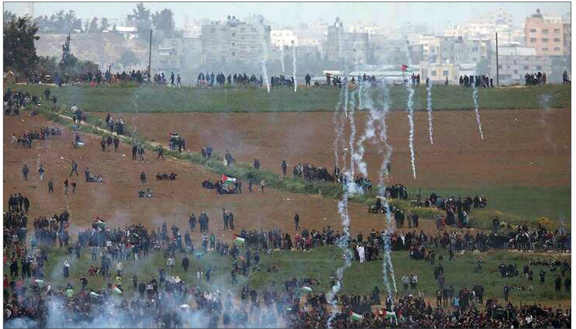
Israeli forces fire tear gas and live ammunition at Palestinian protesters near the Gaza border fence during the start of the Great Return March, as seen from the Israeli side of the border, March 30, 2018.

It’s important to understand the context, the motivation, and the name for this massive popular action. Seventy percent of the